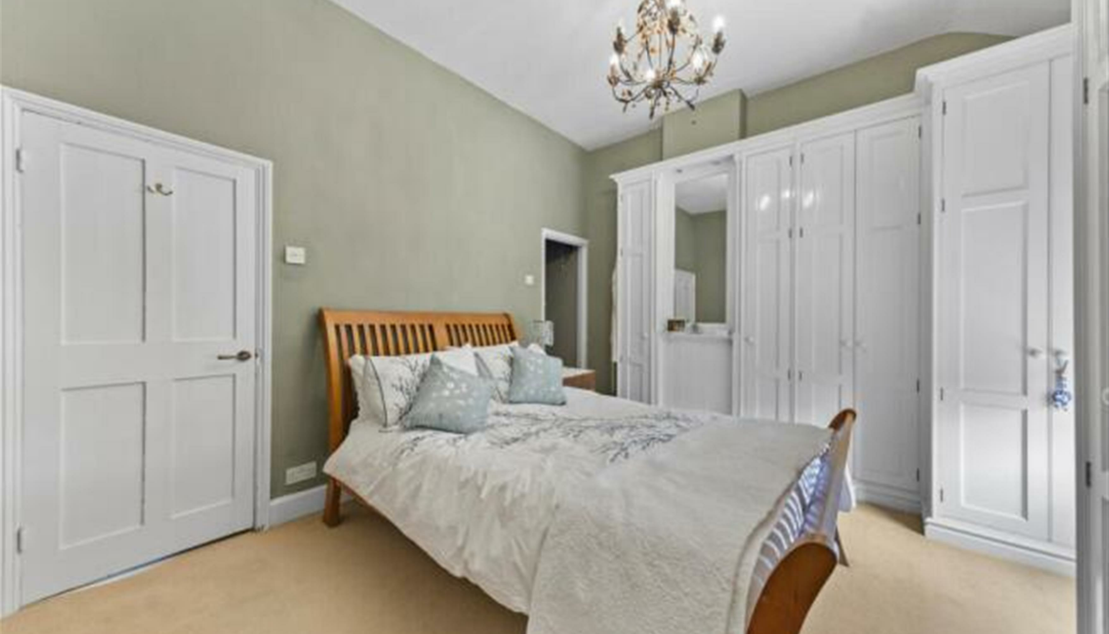
Room at 28 Port Road Northampton, NN5 6NL